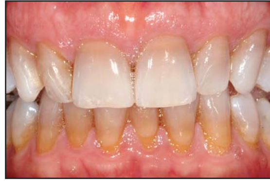
Figure 12. Preoperative facial appearance showing poor occlusion, malpositioned and discolored teeth.

How the model is carved will determine how and where the provisional material is cleaved on the preparation day. Interproximal areas on veneers can be carved deep into the stone model but need to be