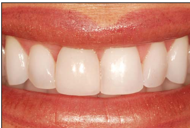
Figure 1. Preoperative smile has a buccal corridor deficit, malpositioned lateral incisors, and an existing veneer on #8.

Good marginal adaptation, anatomical contour, and a smooth surface are critical for the provisional to facilitate acceptable oral health. This is particularly important when placing subgingival margins so that tissue health remains ideal for cementation. Rough, over- or under-contoured margins can contribute to plaque accumulation and make it difficult for proper oral hygiene. This may lead to compromised gingival health, which can significantly affect the overall health of gingival tissues as well as the aesthetics of the final restoration due to gingival inflammation or gingival recession. 1 The provisional restoration should promote healing of the gingival tissues and the development of proper gingival contours so that the final restoration can be delivered without tissue damage or bone loss. 2 The provisionalization phase also enables maintenance of tooth position; inaccurate