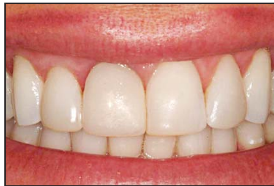
Figure 2. Following initial tooth preparation, maxillary provisionals were fabricated intraorally with virtually no flash and minimal to no adjustments required.