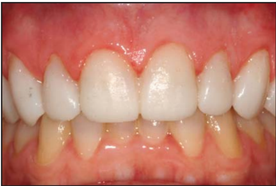
Figure 11. Small deficits at the gingival line such as the one apparent on tooth #6(13) were filled in with a flowable composite and the provisional restorations were finalized.

gingival cavosurface margin of the teeth carried into the interproximal so as to allow for flossing of the gingival embrasure spaces (Figure 3).