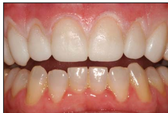
Figure 9. Note the immediate function and appearance that do not require any adjustments when the provisional restorations are placed properly.

Upon receiving the wax-up, if the patient approves of the final appearance, it can be duplicated by taking