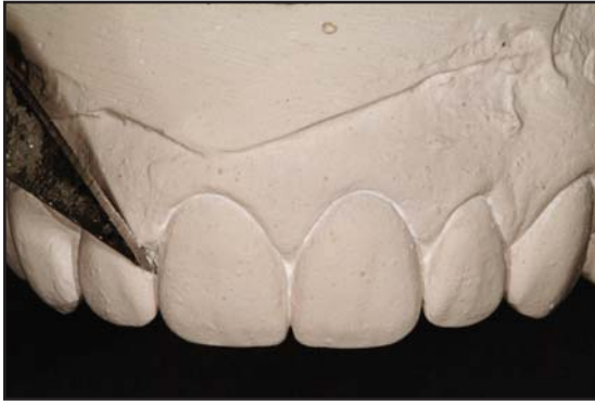
Figure 4. Approximately 0.5 mm of marginal tissue reduction was also positioned to facilitate development of bead line provisional restorations.