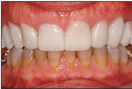
Figure 13. Following initial tooth preparation, maxillary provisionals were fabricated intraorally with virtually no flash and minimal to no adjustments required.