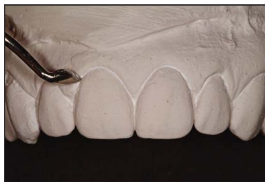
Figure 3. Approximately 0.5 mm to 1 mm of tooth structure reduction was needed where the final margin was to be placed.

provisionalization may cause the need for adjustments or potential remakes of the definitive restoration. 3-6