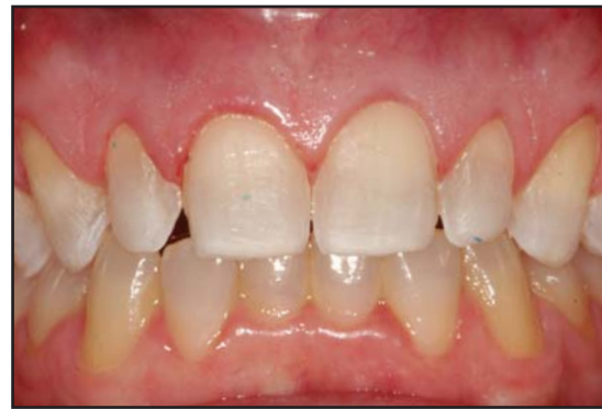
Figure 8. A minimally invasive preparation design was selected to allow maintenance of natural tooth structures while addressing the patient's aesthetic concerns.

diagnostic wax-up. The ideal reduction should be performed on each tooth that is to be waxed, with no alteration to the gingiva. This area should remain untouched as it will be instrumental in the fabrication of the provisional. The final tooth-reduction parameters can be delegated to the laboratory. This step does, however, enable the clinician to obtain valuable information with regard to the preparation of malpositioned, rotated teeth that may have unaesthetic diastema spacing and will require careful evaluation of occlusion. Therefore, preparation of the teeth on the model should be performed by the dentist to facilitate this close evaluation. In addition, the laboratory may prepare the teeth differently than the dentist, which could potentially change the outcome of the entire case. The laboratory will use this prepared model for their diagnostic wax-up.