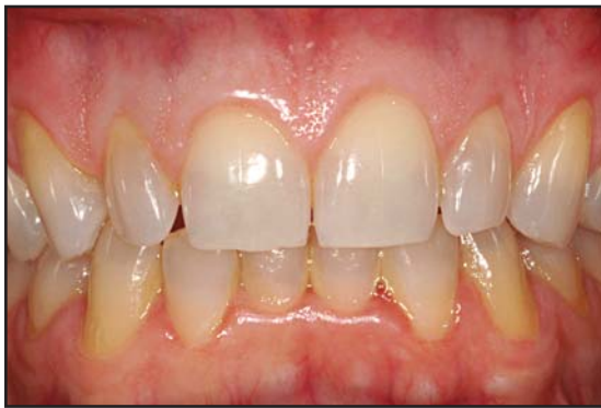
Figure 7. Initial appearance prior to tooth preparation for feldspathic veneers on teeth #4(15) through #13(25).