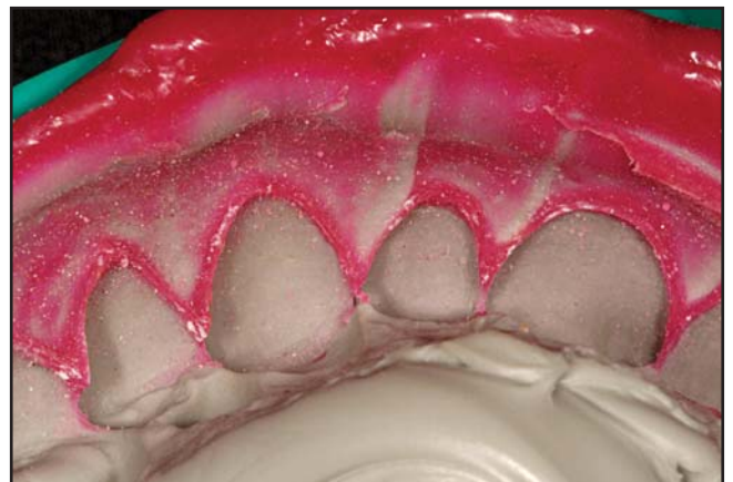
Figure 6. The bead lines scribed into the tooth structure on the model function as a pressure point to facilitate separation of the excess material without the need for hand or rotary instruments.

The key to fabricating an optimal provisional restoration is in the initial setup, which involves (at minimum) three sets of diagnostic models, showing the teeth and marginal gingival tissues. The models need to be checked for accuracy, a facebow will be needed also to mount the casts properly to an articulator, and the models will then need to be properly articulated and equilibrated. 7 One set of models will stay in the dental office as a control to show original contours and function, as well as to act as an archive depicting the case for legal purposes. The second set of models is used to practice tooth preparation along with proper tooth reduction for the laboratory to then utilize for the