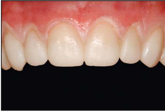
Figure 10. Magnified view of provisional restorations following removal of the bead line template. Note the yellow line from the tooth structure at the gingival margin where the excess acrylic will be peeled off with a hand instrument.