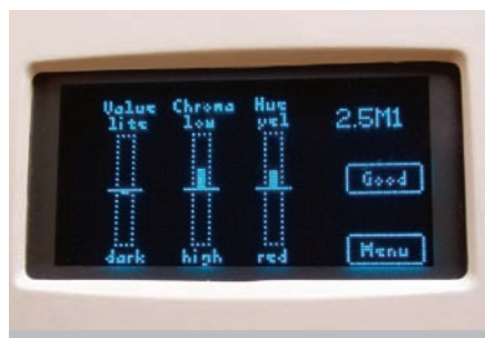
Figure 3 Readout showing shade verification for value, chroma, and hue.