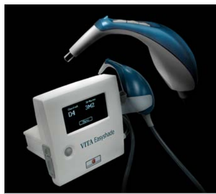
Figure 1 Small, portable, self-contained shade-taking device (Easy Shade, Vident).

The implementation of shade-taking devices in the dental office involves many