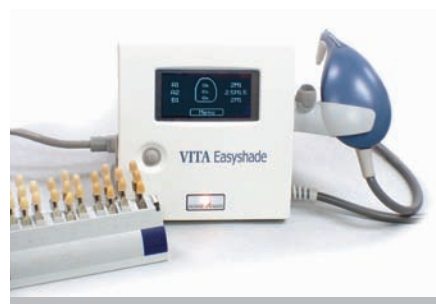
Figure 4 Numerous shade readings are available, along with different shade readouts.

as well as reinforce how a cleaning can help the whiteness of teeth. In addition, it can also demonstrate to some patients that a cleaning alone cannot whiten every patient's teeth. This is a perfect opportunity to inform the patient about a dentist-provided whitening system to lighten their discolored teeth. Dental assistants can implement the shade-taking device on every patient having restorative treatment. This can save a great deal of time for the dentist. When entering the operatory with the patient, the assistant can help the patient to get seated and then perform a shade analysis of the tooth to be worked on along with the adjacent and contralateral teeth for reference.